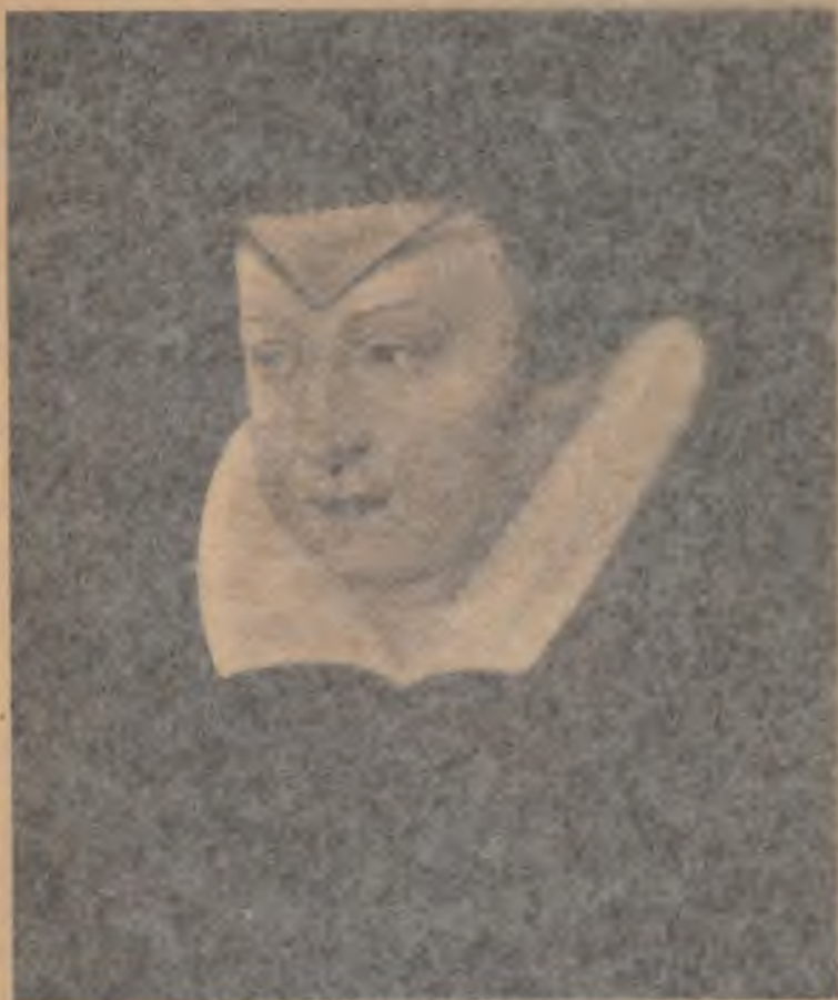
Catherine de Medici